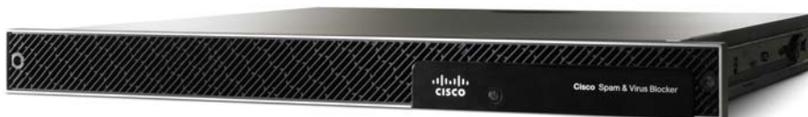
Figure 1. Cisco Spam & Virus Blocker