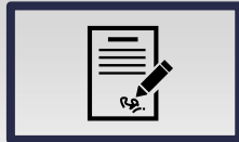
Enterprise Licensing Agreement