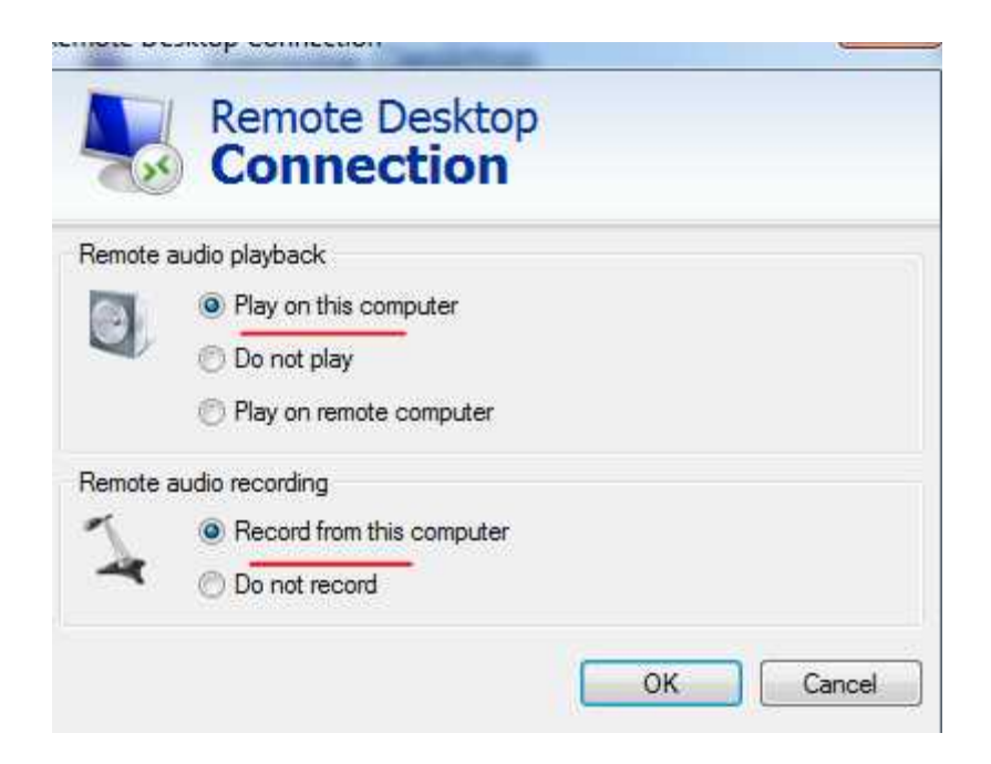
Step 2: Installing Virtual Audio Cable: