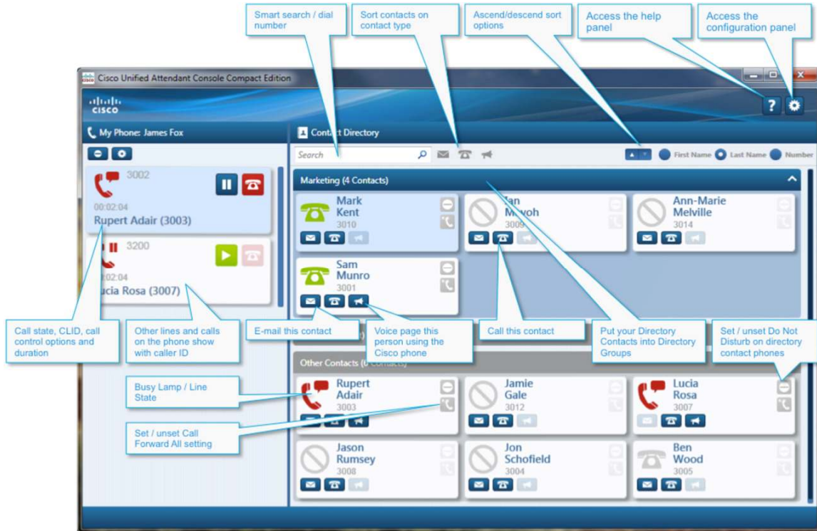
Figure 2. Compact Edition Contact Options