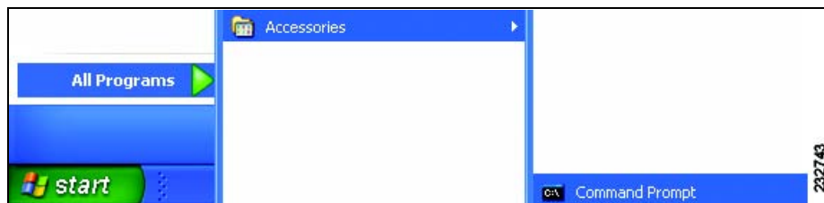
Figure 4 Start > All Programs > Accessories > Command Prompt