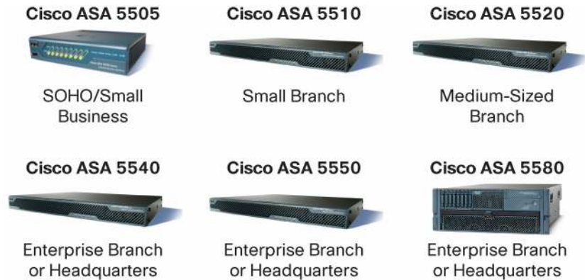
Figure 1. The Cisco ASA 5500 Series Portfolio

Table 2 summarizes the VPN performance of each Cisco ASA 5500 Series model.