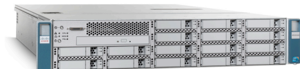
Figure 1. Cisco UCS C210 M2 Server

Designed for applications such as virtualization, network file servers, application servers, appliances, storage servers, database servers, and content-delivery servers, the Cisco UCS C210 M2 server packs up to 16 Small Form-Factor (SFF) SAS, SATA and SSD drives into only two rack units, for a total of up to 16 terabytes (TB) of storage.