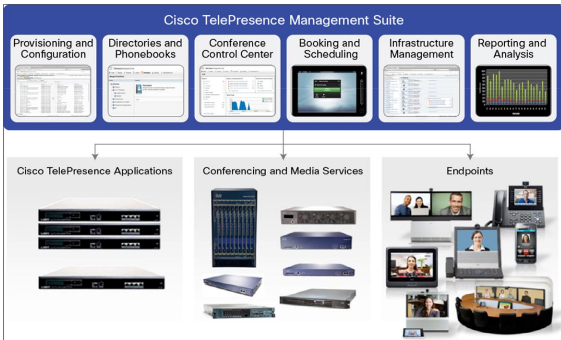
Figure 1. Cisco TelePresence Management Suite

Cisco TMS provides you with scheduling, control, and management of Cisco TelePresence conferencing and media services infrastructure and endpoints, enabling you to improve productivity, reduce costs, and increase return on your Cisco TelePresence investments (Figure 1).