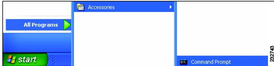
Figure 1 Start > All Programs > Accessories > Command Prompt