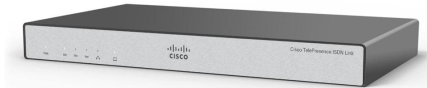
Figure 2. ISDN Link in a Telepresence Network Configuration