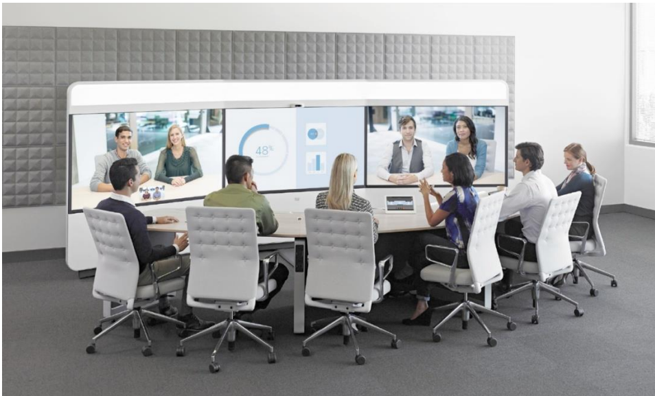
Figure 1. Cisco IX5000, Six-Seat System

This sleek and powerful system incorporates an elegant triple 4K Ultra High Definition (UHD) camera cluster, three high-definition 70-inch LCD screens, and theater-quality audio to bring people together as if they were just across the table. The IX5000 Series includes the single-row, six-seat IX5000 system, and the dual-row, 18-seat IX5200 system.