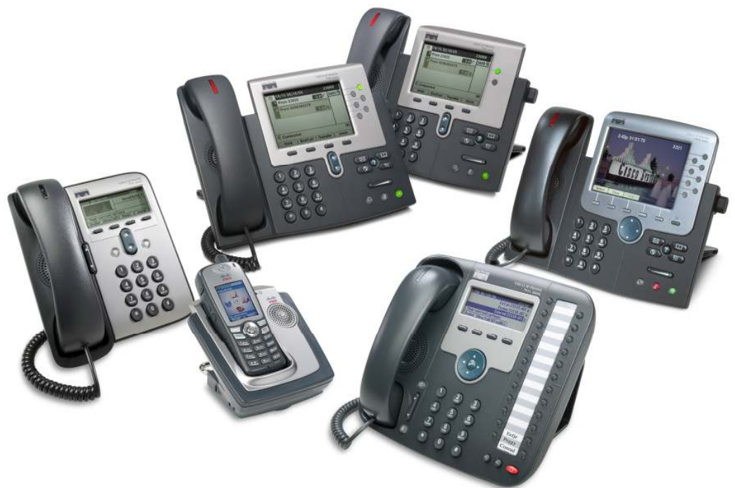
Figure 3. Cisco Unified IP Phone Portfolio

The Cisco Unified IP Phone portfolio includes options for use from wherever you are: the company lobby, the manufacturing floor, the executive suite, at home, on the road, or in a branch office (Figure 4).