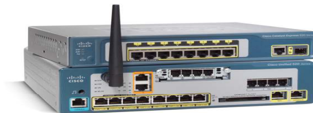
Figure 2. Cisco Unified Communications 500 Series: 24- and 32-User Configuration