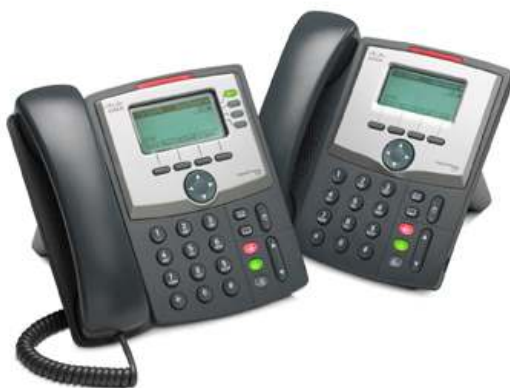
Figure 4. Cisco Unified IP Phone 500 Series

The phones in the Cisco Unified IP Phone 500 Series work exclusively with the Cisco Unified Communications 500 Series for Small Business and cannot be used with other Cisco call processing platforms.