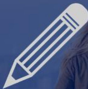
Annotation Tool Functions