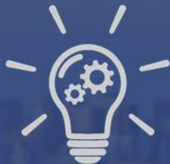
PowerPoint Design Concepts