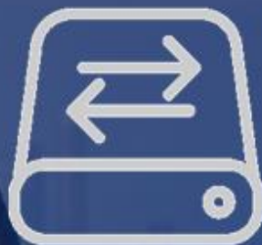
Secure File Transfer