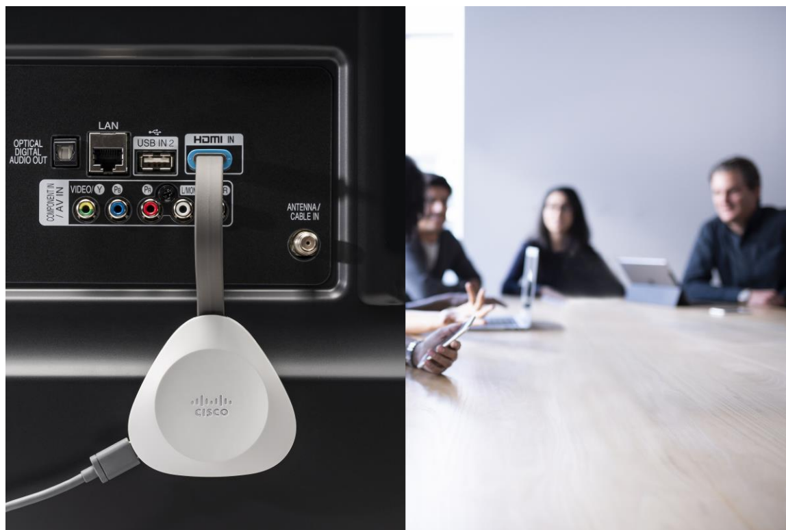
Figure 3. Webex Share installation

Cisco Webex Share is installed behind the screen (Figure 4). The package includes a cable management sticker that allows users to correctly position the device behind the display and to avoid mechanical stress on the HDMI port. The HDMI cable has been designed to sustain the device weight.