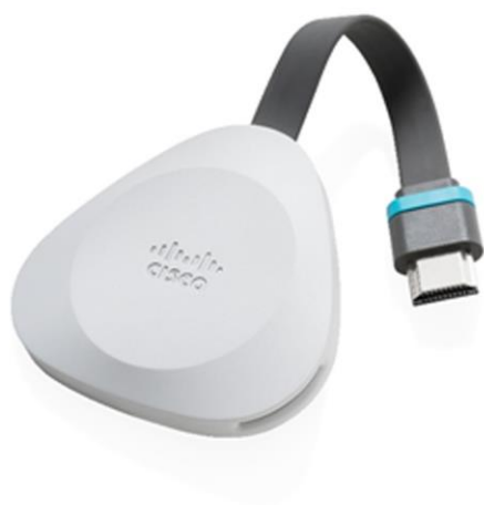
Figure 1. Cisco Webex Share

Cisco Webex Share complements the premium portfolio of Cisco Webex collaboration devices, enabling conference rooms and huddle spaces to offer the same Webex user experience as Cisco's video devices.